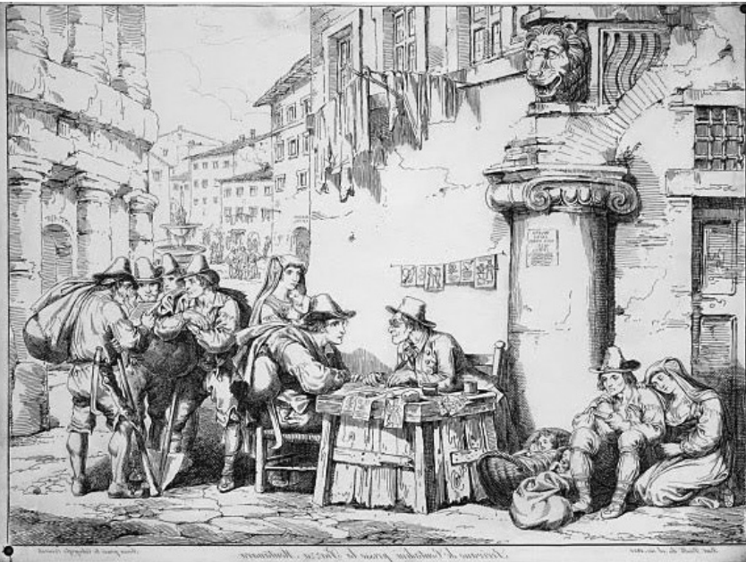
A public scribe in the Piazza Montanara. A scribe prepared documents for people who were often illiterate.