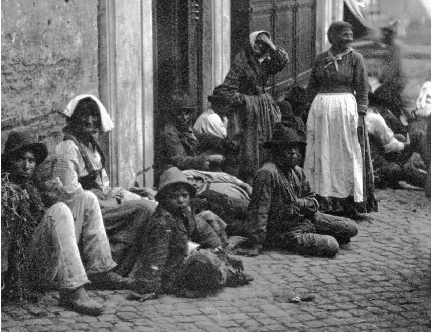
A 19th century photograph of people in the Piazza Montanara.